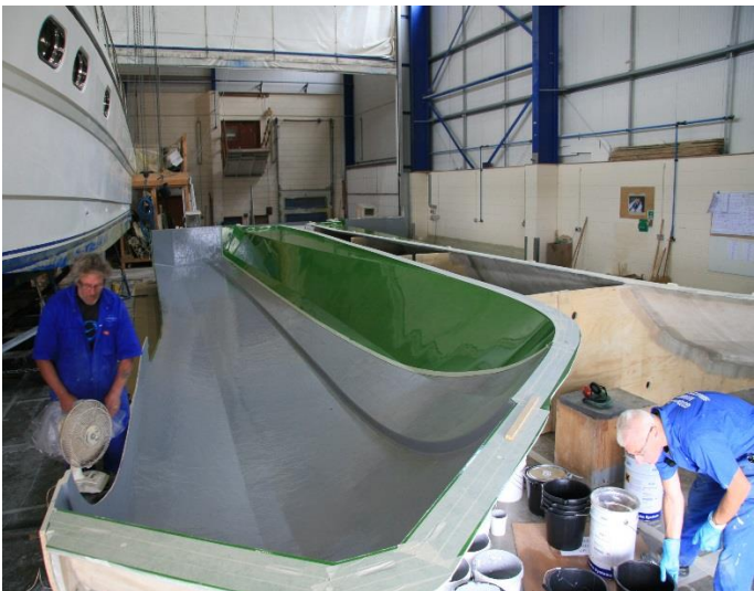
Stage 1: Gel coats applied to topsides