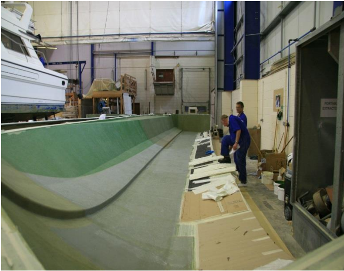
Stage 2: Application of GRP laminates