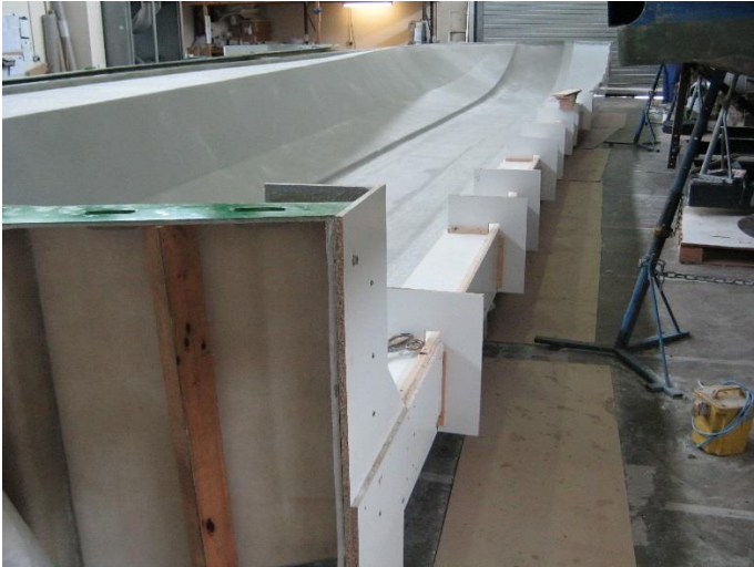
Gunwale / combing undergoing lamination process