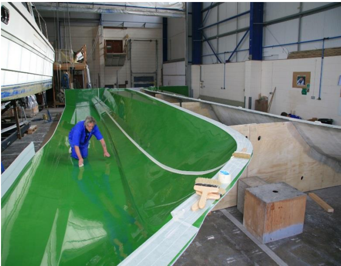
Mould tool undergoing surface preparation