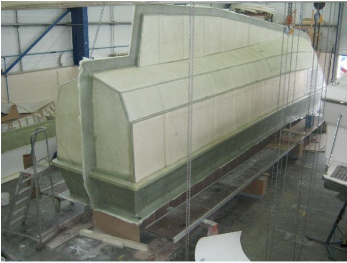
Hull mould tooling completed