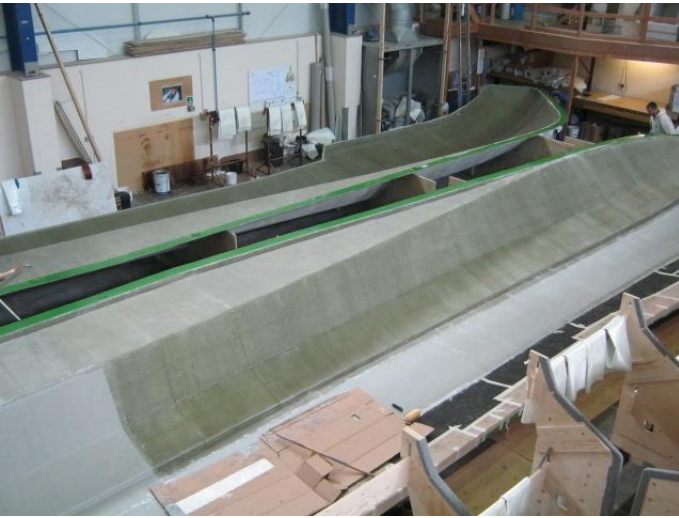
Port Hull: Application of GRP laminates