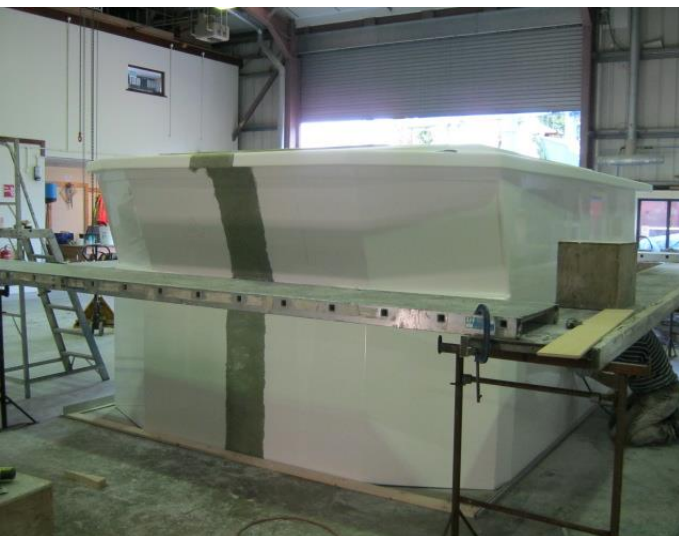
Looking Aft: Wheelhouse undergoing join up process