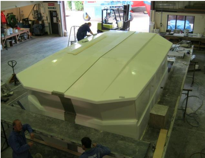
Wheelhouse from above