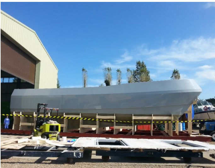
Hull lines and proportions