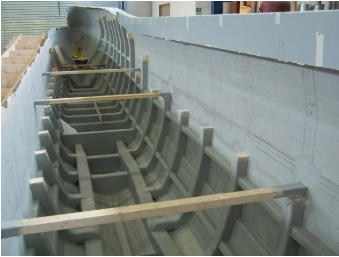
Fully framed and completed starboard hull ready for mould release