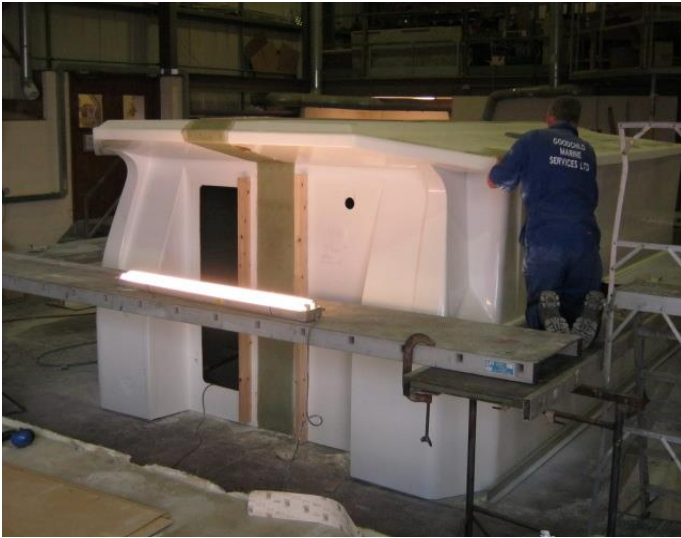
Looking Forward: Wheelhouse undergoing join up process