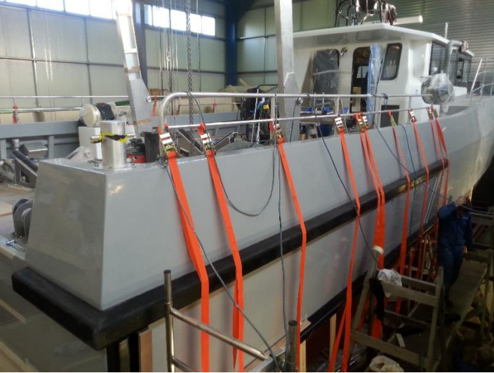
Starboard side fendering section undergoing fitment