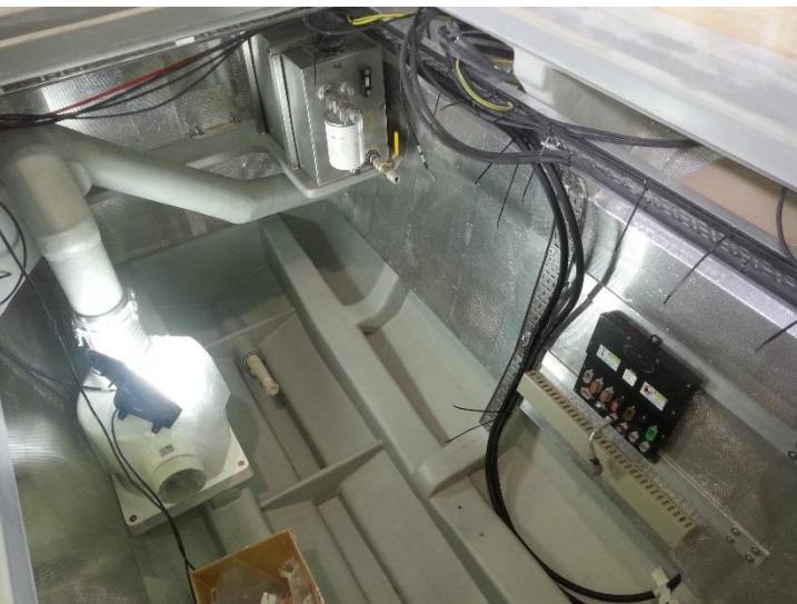
Stbd side engine compartment ready for engine install