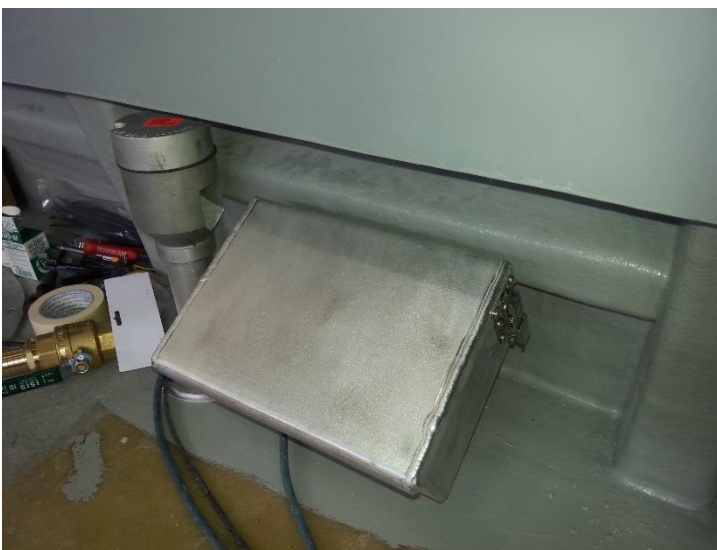
Portside fuel filler complete with save-all and tank vent