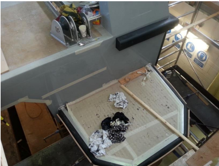
Starboard side transom boarding platform