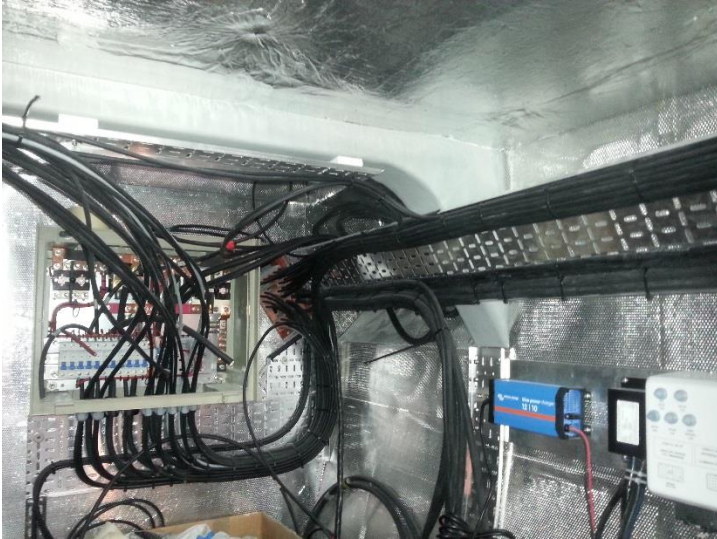
Cable installation (portside engine compartment)