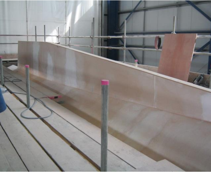
Keel section looking aft, filled and faired