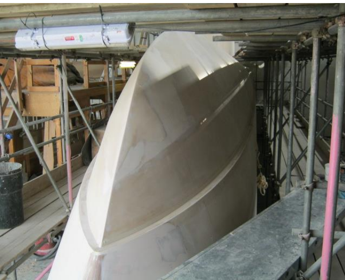
Bow and forefoot section looking aft, filled and faired