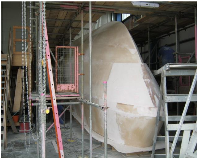
Bow section filled and faired

Notes: Meeting with Ribcraft, Goodchild Marine and NIFCA representatives scheduled of 10 th June at Seawork 2014 to discuss 5.3m commercial RHIB procurement . Awaiting return of Lloyds structural assessment booklet from Mecal Limited