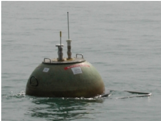
Figure. 1: Waverider Buoy (approx. 1m diameter)

Recording oceanographic equipment will be moored in the vicinity of: