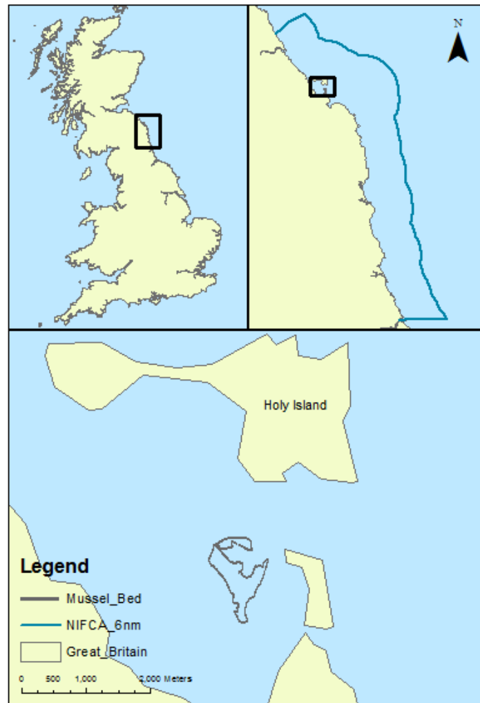
Figure 1. The study area, showing the mussel bed in relation to Holy Island.

The study site is located on the mussel bed at Fenham Flats, Lindisfarne on the extensive mud-flats south of Holy Island, located within the Lindisfarne National Nature Reserve (NNR).