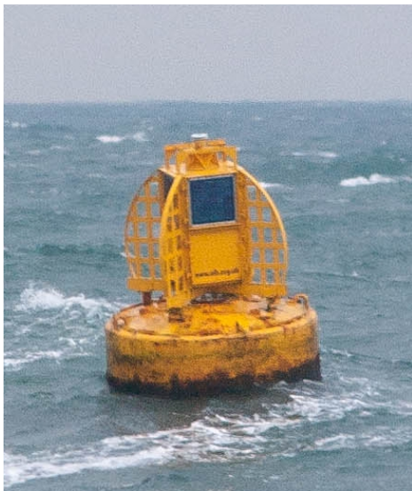
Figure. 2: Class 2 Guard Buoy

Wave data are freely available from the WaveNet website: