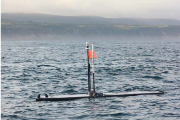
Figure. 1: Wave Glider

The instrument (ca. 3m long x 0.6m wide) travels slowly on the surface under wave power. It is fitted with an orange flag, all-round white light and Radar Target Enhancer.