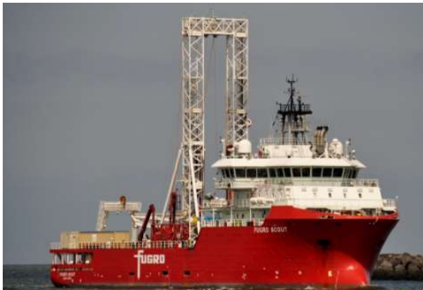
MV Fugro Scout