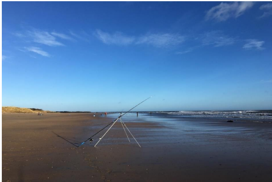
Figure 2: NIFCA Officers attend the 2020 Amble Sea Angling Clubs' annual Amble Open Competition.

Currently, NIFCA officers meet recreational sea anglers at a variety of local and regional angling events (Figure 2), and during district (onshore and offshore) patrols to ensure fishing activity follows all regulations. Compliance checks with local anglers primarily focus on minimum conservation reference sizes of a number of protected species within the district (NIFCA Byelaw 3).